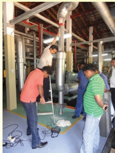
ISB Team During the Energy Audit

ISB was conducted the independent detail Energy Audit (EA) at the premises under the request of QICS. This was the first attempt of ISB getting involving with independent energy audit related to international energy standards. ISB has trained experts on both BS EN 16001 standard and ISO 50001:2011 international energy systems through Confederation of Indian Industries (CII), India with the help of the SWITCH-Asia