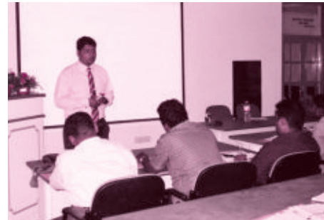
Off Site training Session on Energy Management (Kurunegala)

Industrial Services Bureau (ISB) focusing on the Energy Stream of the programme was able to help SMEs to get aware on the low cost energy conservation mechanisms to adopt in their premises. Addition to offsite energy