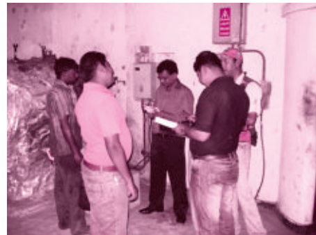
ISB Assining SMEs on SITE