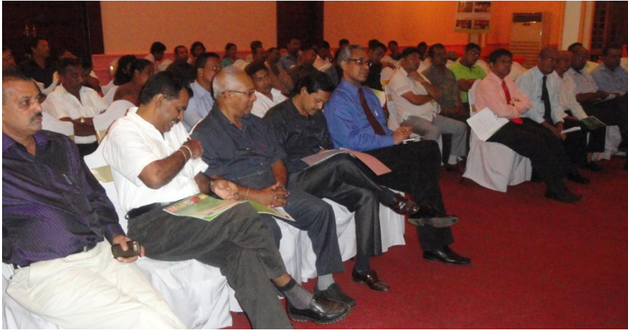
Members at the first SWITCH-Asia GBC